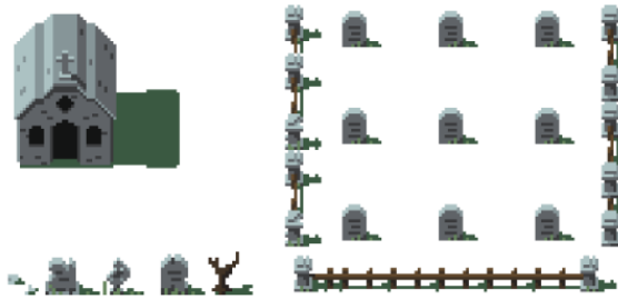
Figure 2: Top left: A mausoleum partial constructed with 16 separate tiles. Right: A graveyard partial with 42 tiles. Bottom left: A series of tiles illustrating low-level features.

a cell reaches an incompatibility point, where every boolean flag within a cell's array is false. If this happens, then the generation process has failed, and WFC will return nothing.